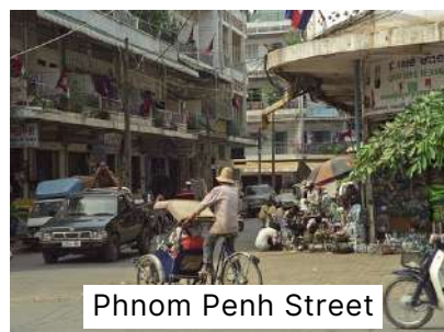
Phnom Penh Street